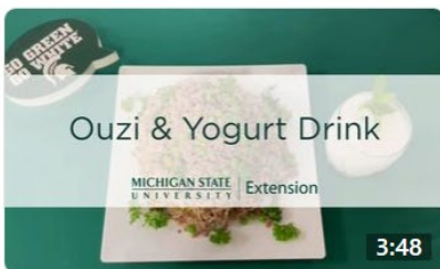
Ouzi and Yogurt Drink 9 weeks ago · 44 views 1

YouTube shares a subset (160) of the Facebook videos and the analytics are above in Social Media Numbers.