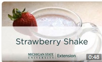
Easy Strawberry Shake 31 weeks ago · 89 views 1