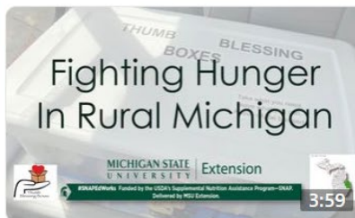
Thumb Blessing Boxes 12 weeks ago · 57 views 2