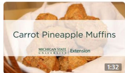
Carrot Pineapple Muffins 37 weeks ago · 136 views 1