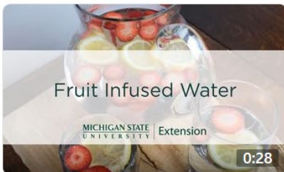
Fruit Infused Water 30 weeks ago · 56 views 2